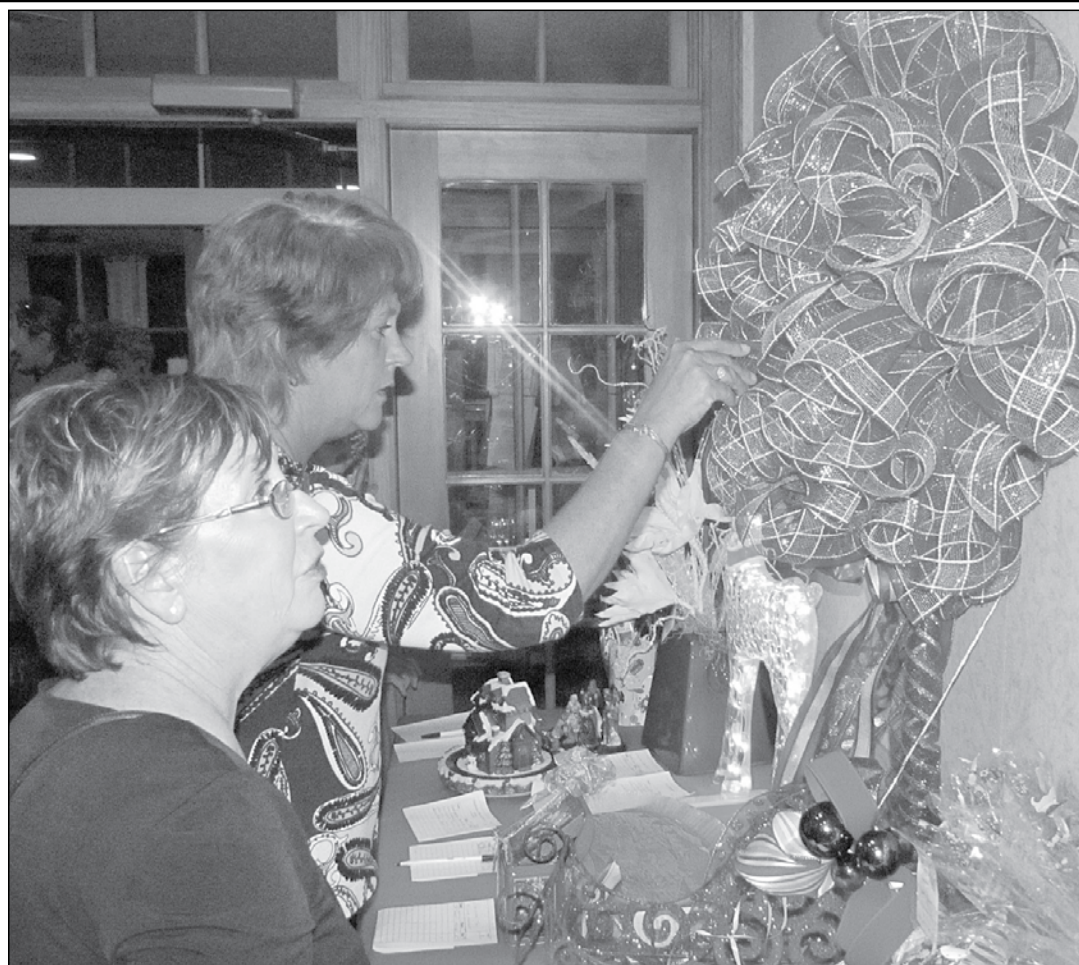
Patrons attending the Silent Auction examine the items for bid. The annual event helps support the Meals on Wheels program.

For more information on the Meals on Wheels program, or to contribute, call Pender Adult Services at 259-9119.