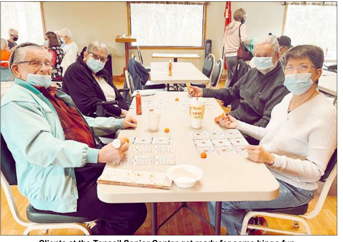
Clients at the Topsail Senior Center get ready for some bingo fun.