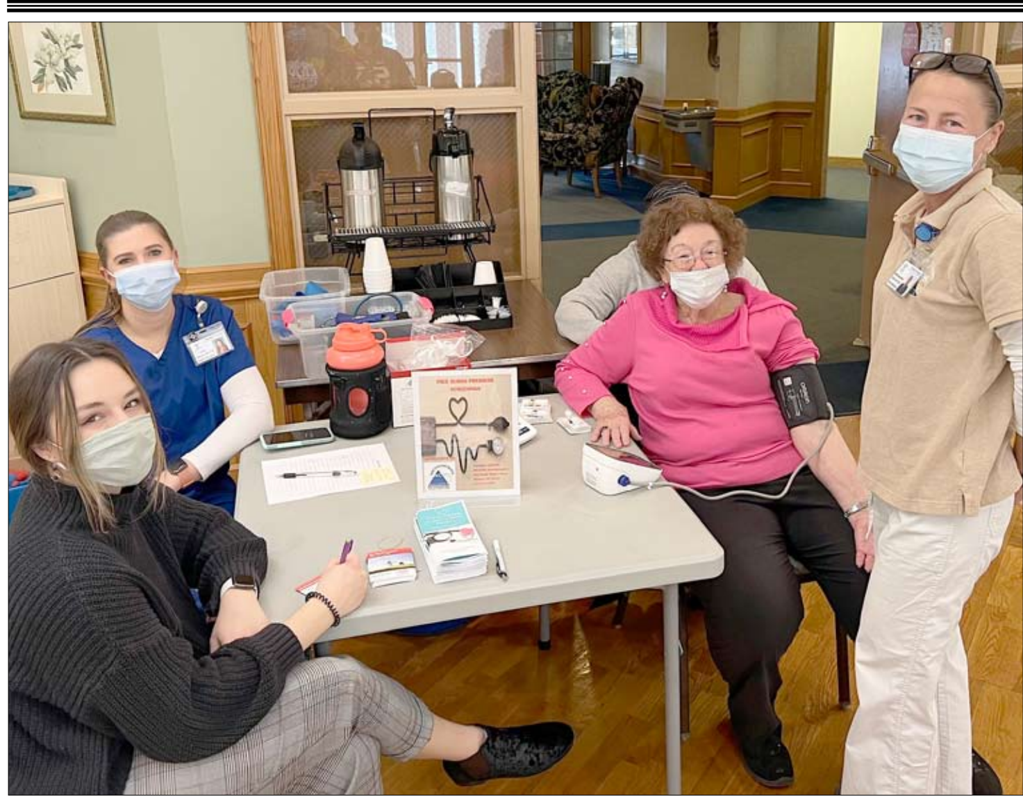
The Pender County Health Department does blood pressure checks at Heritage Place in Burgaw.